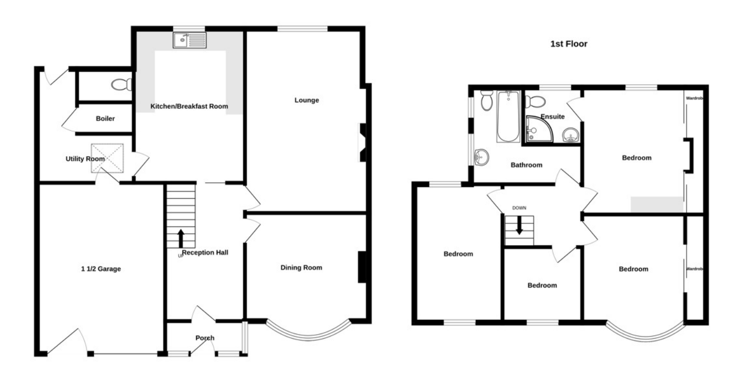
Measurements are approximate. Not to scale. Illustrative purposes only Made with Metropix ©2023